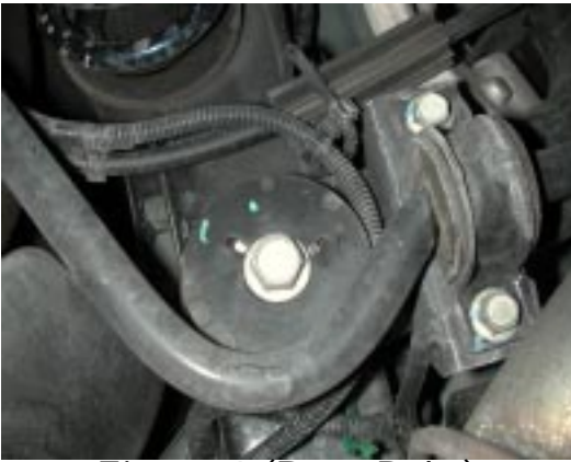
Figure 4 (Rear Bolts)