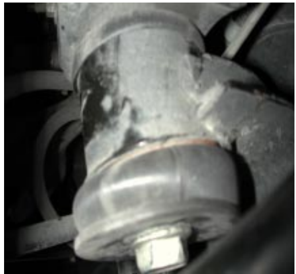
Figure 8 (Front)