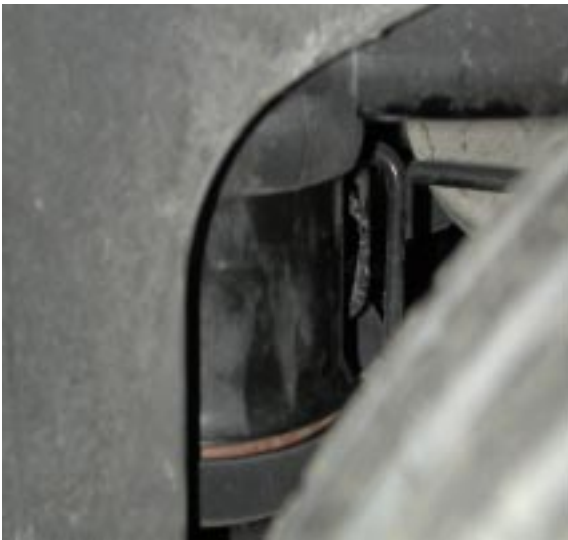
Figure 7 (Rear)

Once installed, the Rear & Front cradle snubber bushings should look as in Figures 7 & 8, respectively.