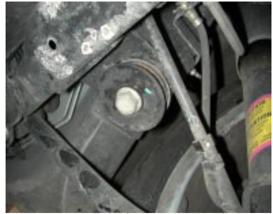
Figure 5 (Front Bolts)